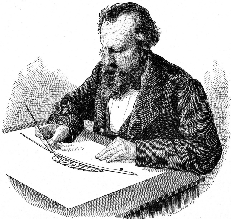
POSITION FOR FLOURISHING.